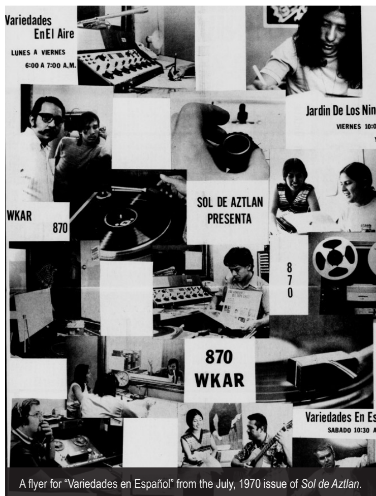
A flyer for “Variedades en Español” from the July, 1970 issue of Sol de Aztlan .