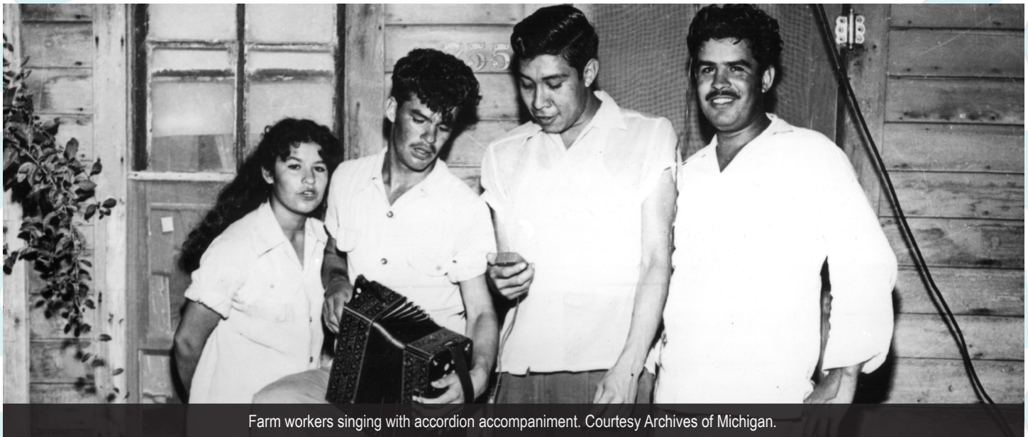
Farm workers singing with accordion accompaniment.